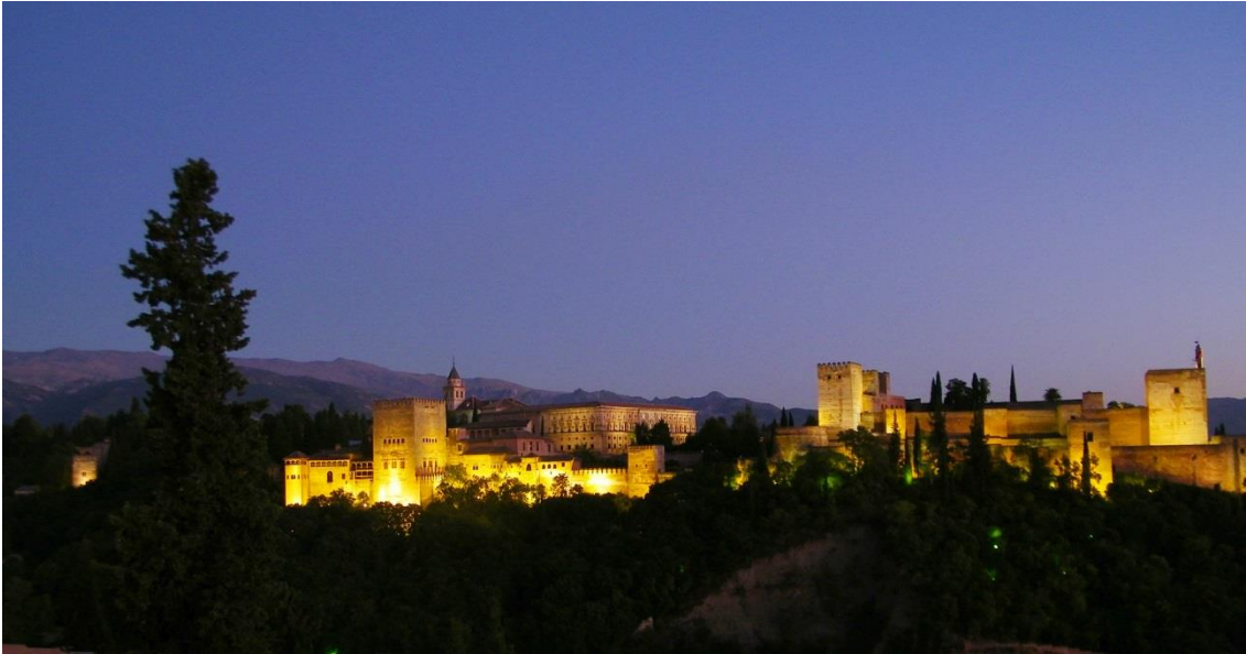
Views of the Alhambra at sunset from the Albaicín neighborhood

Following, we will visit the Albaicín neighborhood and its medieval cisterns, where the views of Granada, Sierra Nevada and the Alhambra are privileged.